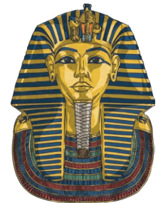
Tutankhamun's death mask

The discovery helped people to understand more about the Egyptians pharaohs .