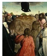
The Ascension by Juan de Flandes