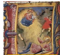
The Conversion of St Paul by Fra Angelico