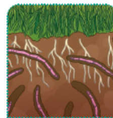
in or on soil