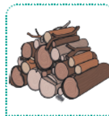
in or under logs