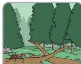
inside rotting wood